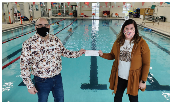
Putnam County YMCA's executive director and aquatics director were approved for a grant for the second-grade swim program.

Through the members who donate by rounding up their bill each month, we are able to make a large impact to these and other organizations in our service area. If you know of an organization in need of funding, have them contact us or go to our website for more information. The next grant deadline is April 19, 2021.